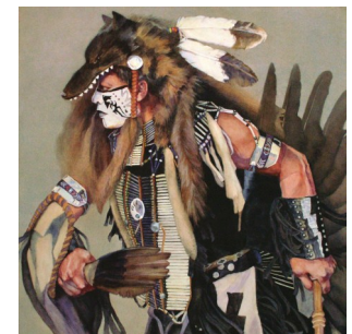
Dance of The Wolf